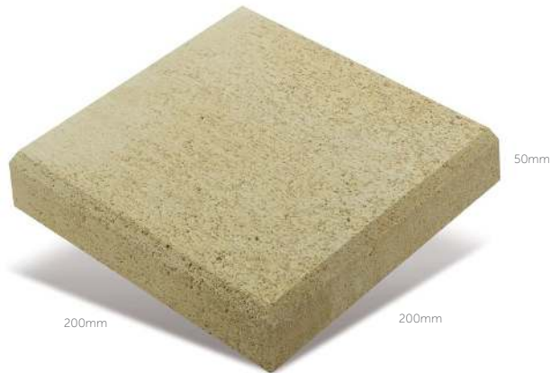
Havenpave® 50 25 units per m 2