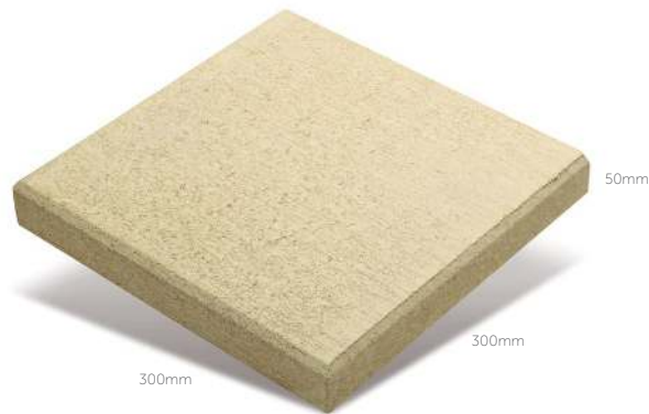
Stradapave® 50 11.10 units per m 2