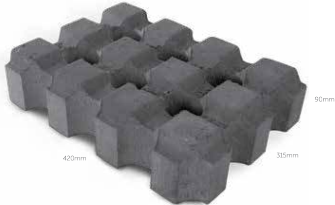
Turfgrid™ 7.56 units per m 2